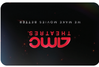
$200 AMC GIFT CARD